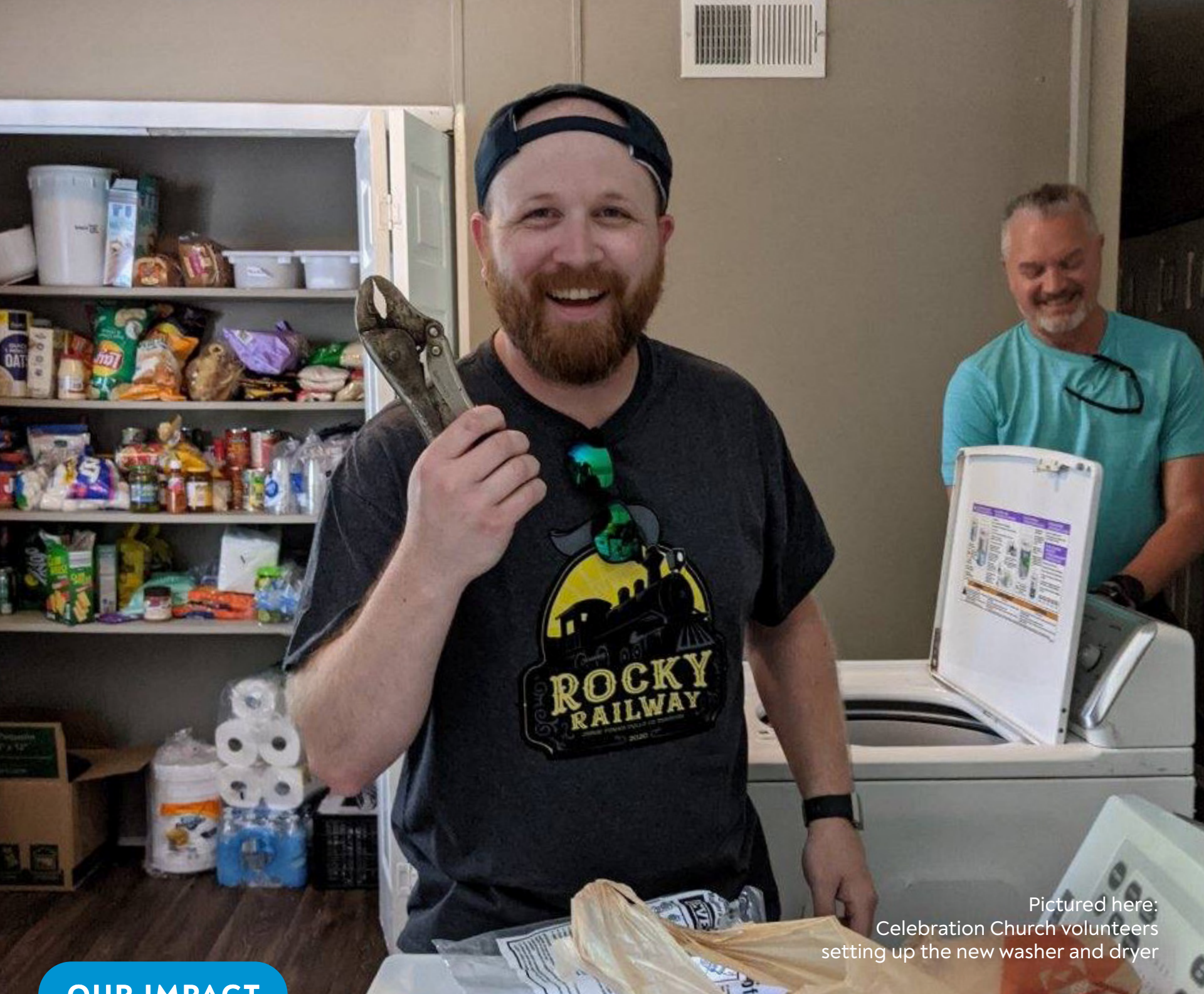
Pictured here: Celebration Church volunteers setting up the new washer and dryer